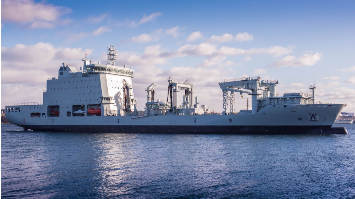
Figure 1. The Asterix underway

The fore and aft mooring stations are equipped with electrically driven mooring winches rigged with high modulus polyethylene (HMPE) lines. The mooring lines were not fitted with mooring pendants. The forward mooring station is fitted with 2 combined anchor windlasses and mooring winches, 1 on either side of the centreline, and an independent mooring winch forward and on the centreline. All 3 winches are controlled from a single point on the vessel centreline, central to the 3 winches. Each winch is fitted with a split mooring line drum and a warping drum.