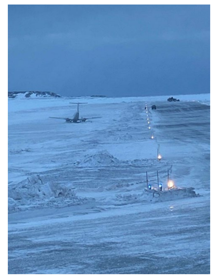
Figure 1. Occurrence aircraft where it came to rest in the snow following the runway excursion at the Sanikiluaq Airport, a few hours after the occurrence

To evacuate, the occupants had to jump from the aircraft from a height of about 5 feet, into the snow. They then walked to the runway and followed it toward the terminal, where they were taken care of by airport staff. One medical staff member received a minor injury during the aircraft's runway excursion.