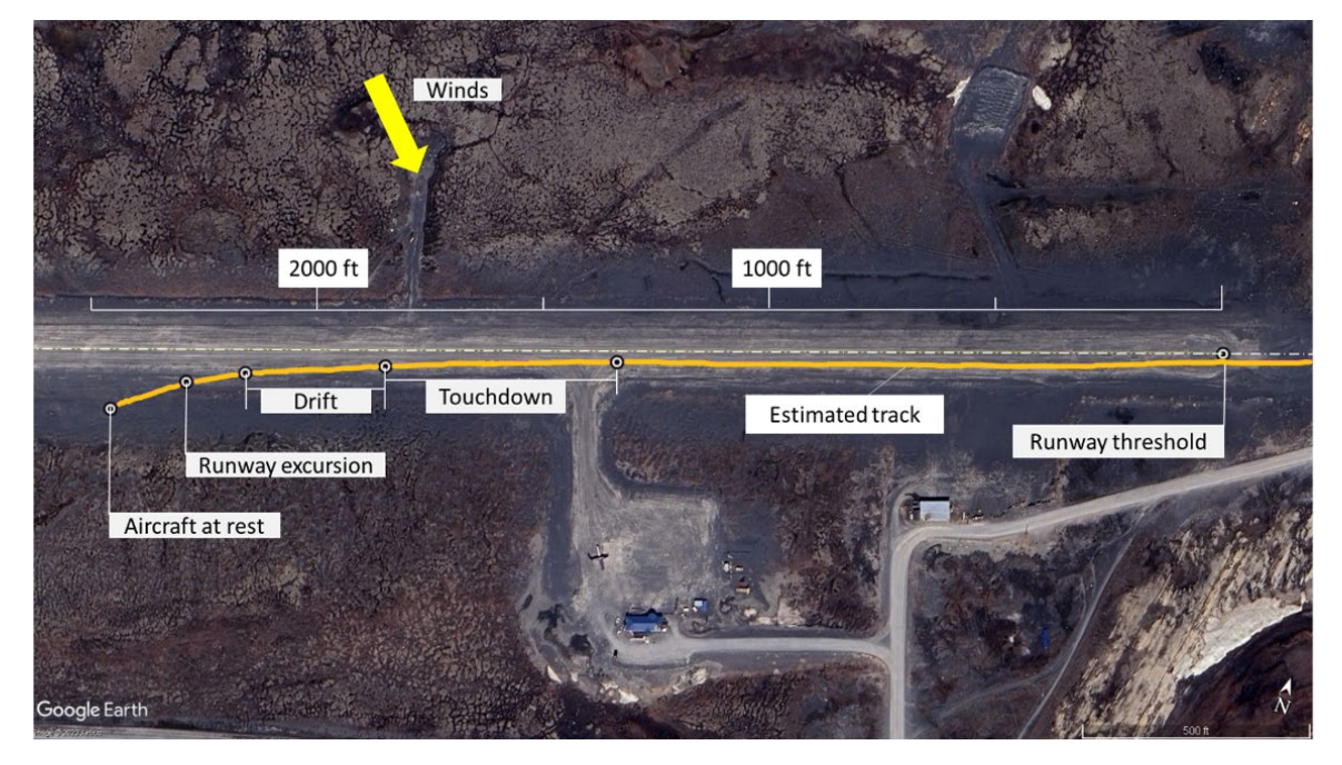
Figure 2. Estimated track of the occurrence aircraft over Runway 27 at Sanikiluaq Airport, along with points where the aircraft touched down, drifted to the left, exited the runway, and came to rest