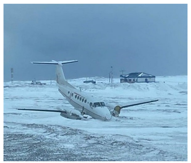
Figure 3. The occurrence aircraft after the runway excursion, stopped with the nose down

No runway lights were struck during the runway excursion.