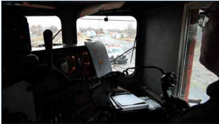
On-board video and voice recorders