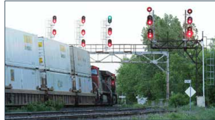
Following railway signal indications