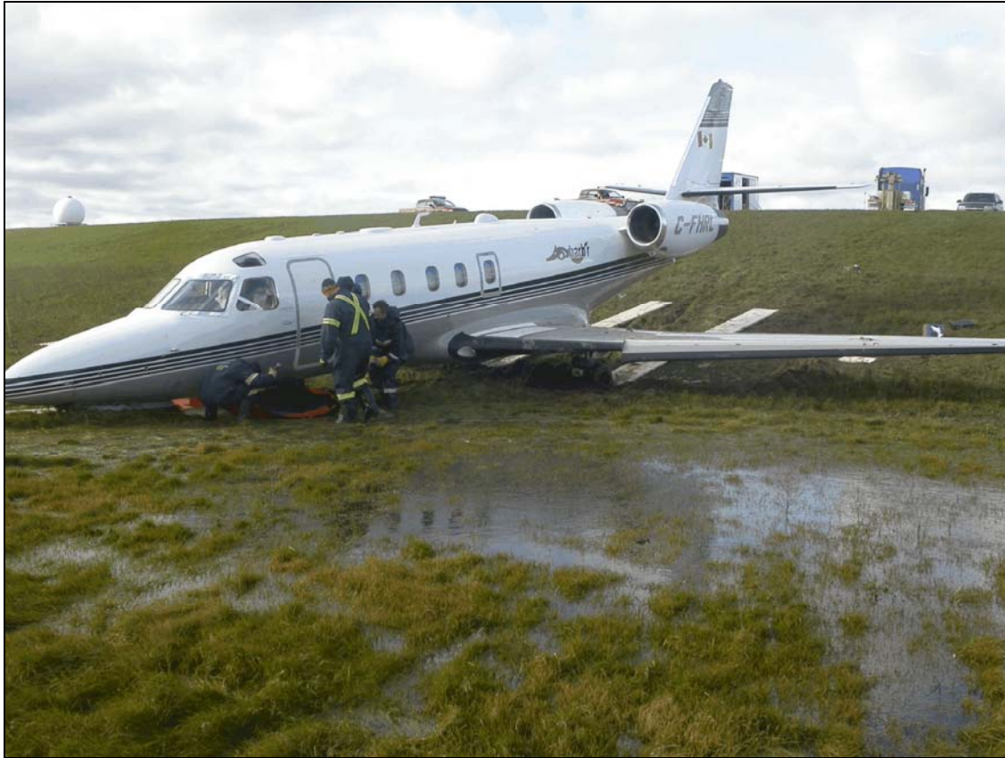
Photo 1. C-FHRL being prepared to be towed back onto the runway.

The following TSB Engineering Laboratory report was completed: