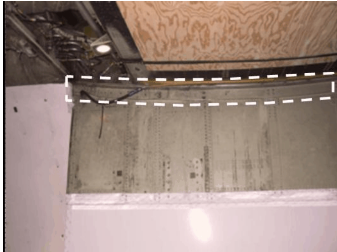
Photo 1. Dashed lines indicate wing attach angle.