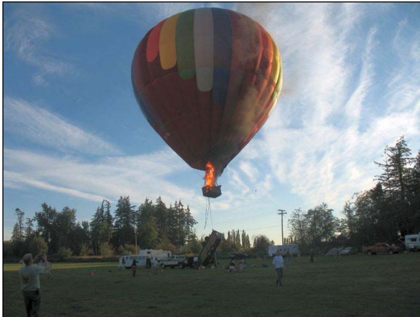
Photo 1. Balloon lifting trailer

As passengers began to evacuate, the basket began to rise, forcing people to jump from a considerable height. The basket rose to a height of approximately 30 feet, forcing the trailer off the ground. As people continued to jump, some struck the trailer sustaining more serious injuries. The strap was made of a synthetic material that was susceptible to heat damage and it failed, releasing the balloon with two passengers still on board. The balloon climbed and drifted to the north. As the fire progressed, the number 2 cylinder fell from the basket. The balloon envelope collapsed and the burning wreckage descended into a residential trailer park. The two passengers remaining in the basket were fatally injured. Three mobile homes and some vehicles were destroyed.