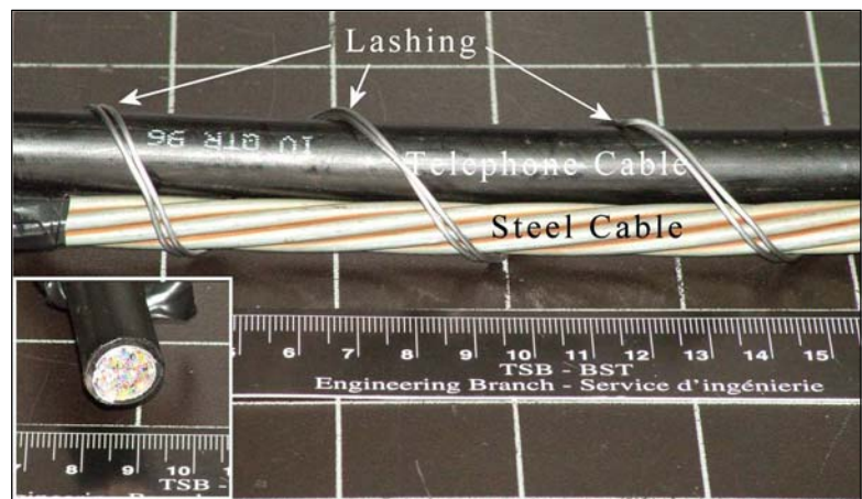
Photo 1. Cable specimen from occurrence site

Examination of the impact damage to the aircraft determined that it struck the telephone cable in the area of the lower engine cowl. Either on impact with the cable or the surface of the water, the engine had been displaced laterally to the right, upward, and aft but remained attached to the engine mount. This displacement caused the cowling to contact and score the propeller adaptor outside diameter. The scoring was rotational in nature, which would indicate the propeller was being driven by the engine when the cowlings departed the aircraft. Continuity 7 of the flight controls was confirmed.