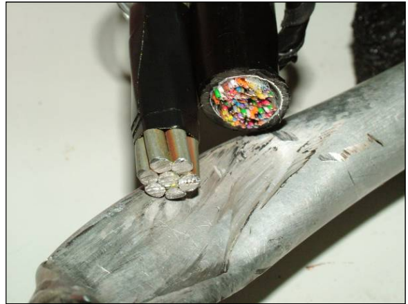
Photo 2. Cable markings on crankcase vent tube

Impact marks and material transfer from the telephone cable were noted on the engine crankcase vent line. The impact marks on the vent line had the same spacing and width as the wires of the steel cable that support the telephone cable (see Photo 2). Neither the propeller nor the main nose wheel tire exhibited indications of damage from possible contact with the cable. However, the right steering arm rod end failed in overload, probably as a result of the impact with the cable, but any material transfer from the cable was probably masked by the engine cowling.