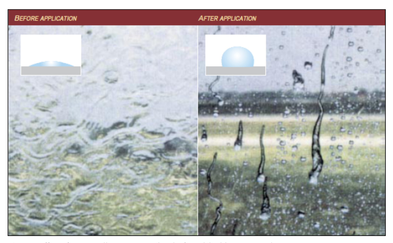
Photo 2. Effect of rain repellent on water droplet/windshield contact angle. 6

All Airbus aircraft are equipped with a rain repellent system. When heavy rain is encountered, the flight crew activates the system by depressing a switch on the overhead panel. The system delivers a calibrated quantity of rain repellent fluid which is dispersed evenly onto the windshield outer surfaces. The repellent fluid is fast-acting and long-lasting with no build-up or distortion and restores visibility in seconds. The surface tension on the windshield is temporarily modified and, combined with airflow, prevents water droplets from adhering to the windshield (see Photo 2).