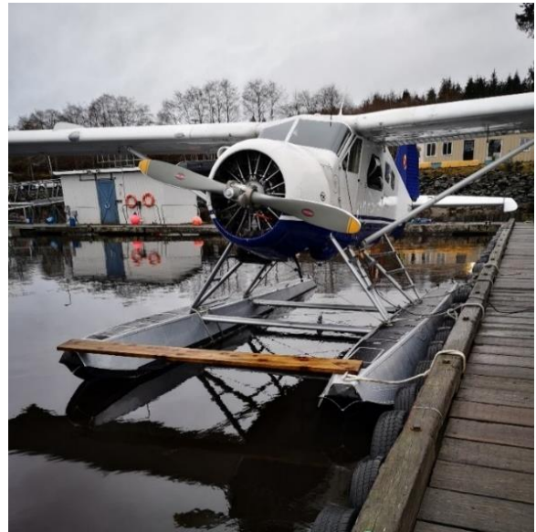
Figure 1. Photo of the occurrence aircraft at the Port Hardy Water Aerodrome, taken 56 minutes after the occurrence, showing the position of the plank

Weather was not a factor in this occurrence.