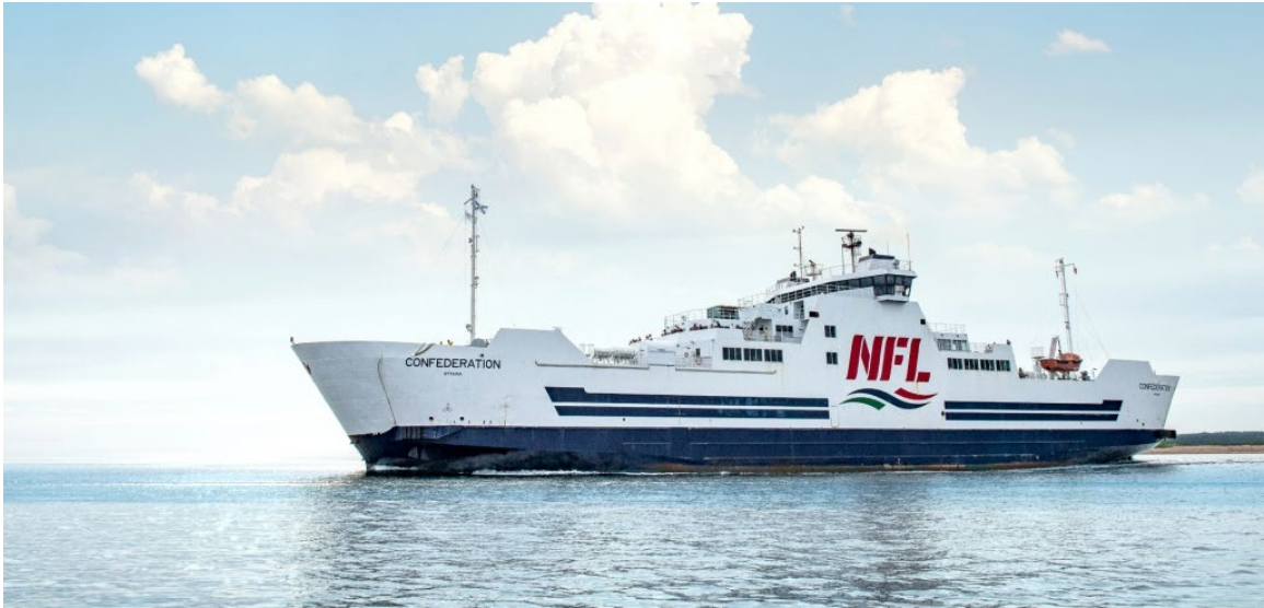
Figure 1. The Confederation

The vessel is registered to the Minister of Transport of the Government of Canada, which is also the authorized representative (AR), and operated by Northumberland Ferries Limited (NFL). The classification society Lloyd's Register is the recognized organization (RO) for the Confederation .