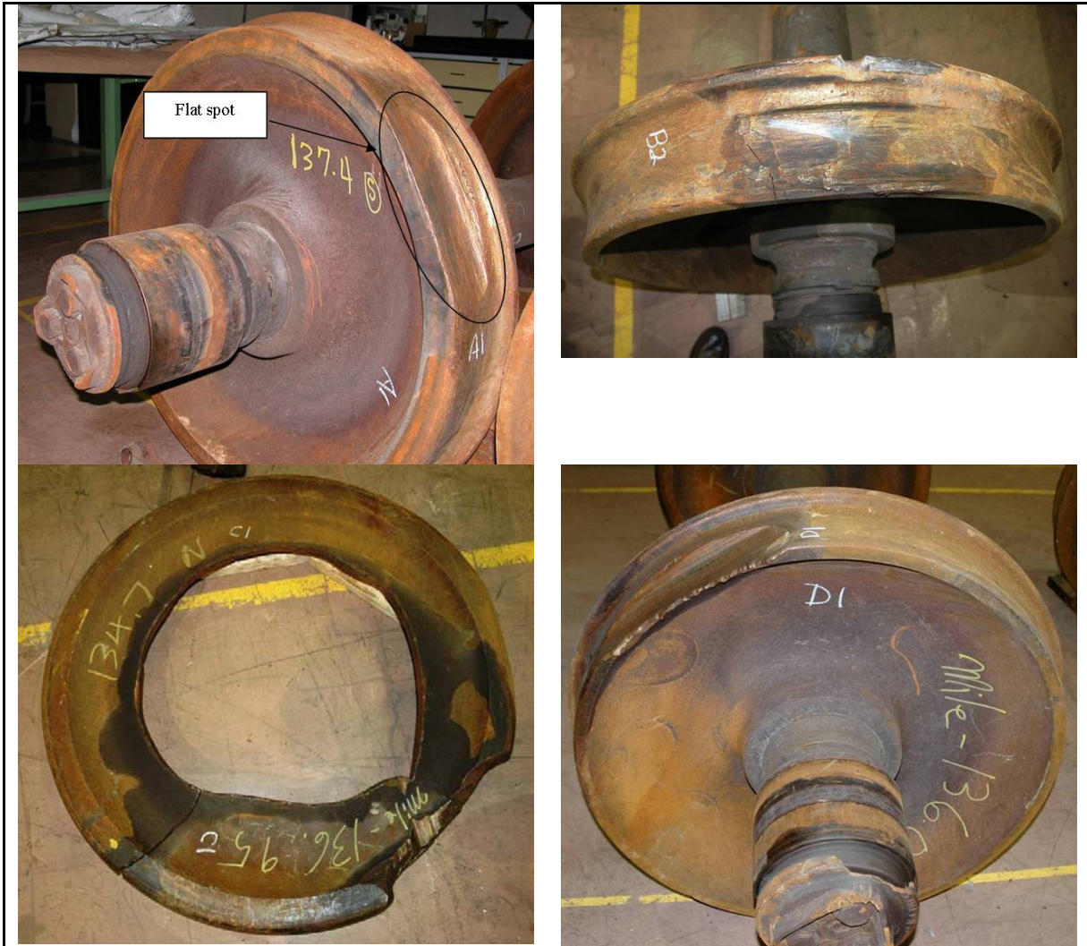
Figure 2. Four damaged wheel sets located at derailment site from car CRDX 7735.

A review of the car's repair history did not indicate any unusual problems with its brake equipment or related running gear. The four damaged wheel sets from this car had large flat spots ranging from 12 to 16 inches in length and had sustained damage to the extent that the wheel plates and wheel rims were fractured (see Figure 2 and Appendix B for details). The wheel sets, broken fragments, brake control valves, handbrake, slack adjuster, and the retainer valve were sent to the TSB Engineering Laboratory for examination (Report LP 046/2007, Examination of Wheel and Brake Components . This report is available from the TSB upon request).