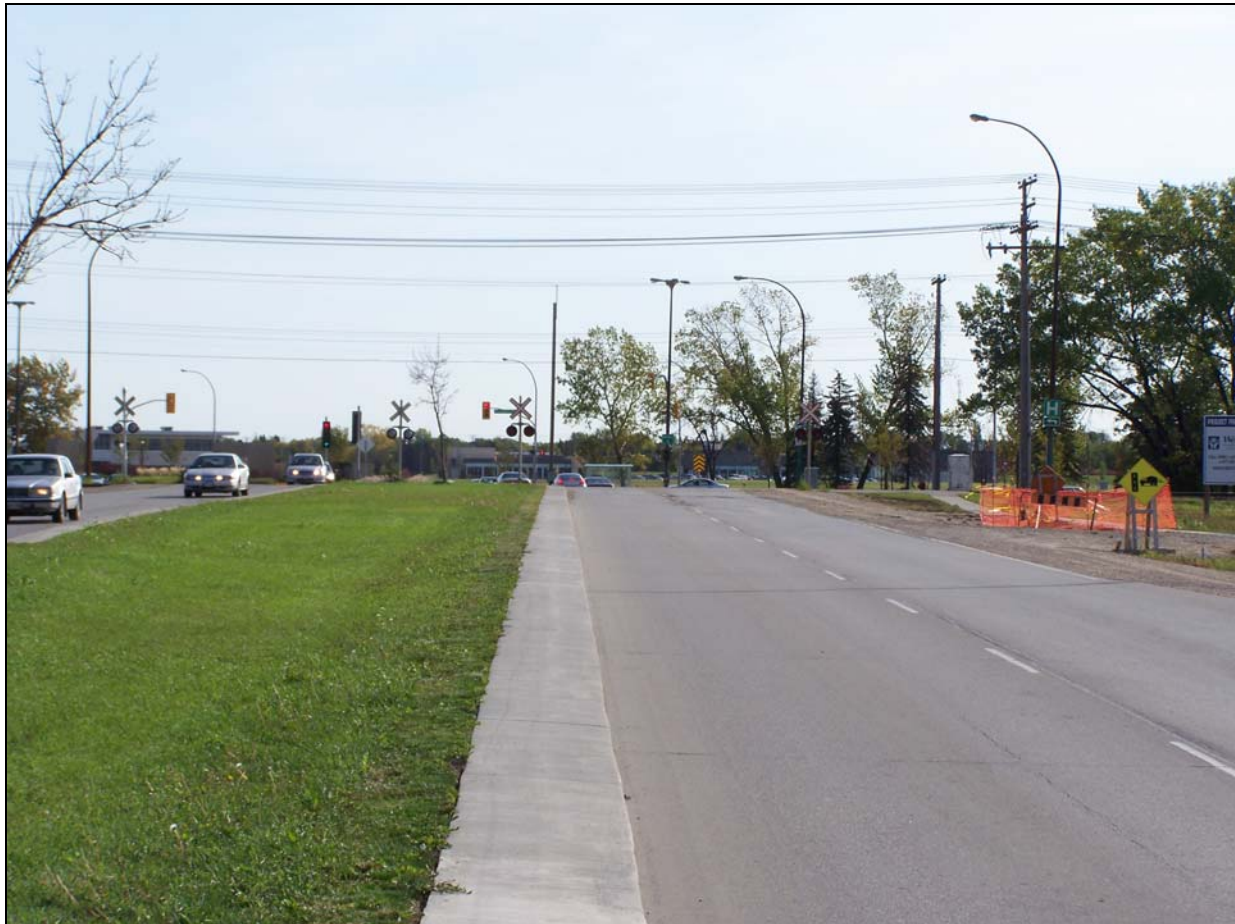
Photo 2. View of the crossing from the median lane of Bison Drive, facing east

Immediately to the north of the railway crossing, there was a row of trees which restricted eastbound drivers' sightlines to the north. A medium-rise condominium under construction restricted drivers' sightlines to the south.