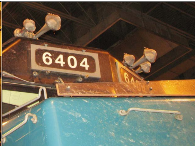
Photo 2. Emergency horn on locomotive VIA 6404