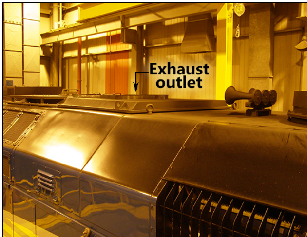
Photo 1. 3-flute horn on locomotive VIA 6404