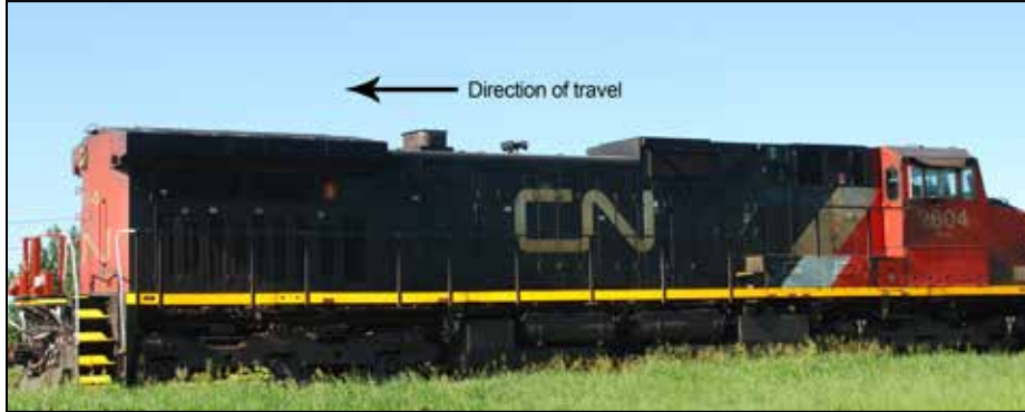
Photo 2. Placement and configuration of the horn on the locomotive

According to section 11.2 of TC's Locomotive Inspection and Safety Rules , locomotives must be equipped with a horn that is "capable of producing a minimum sound level of 96 dB(A) at any location on an arc of 30 meters (100 feet) radius subtended forward of the locomotive by angles 45 degrees to the left and to the right of the centerline of the track in the direction of travel."