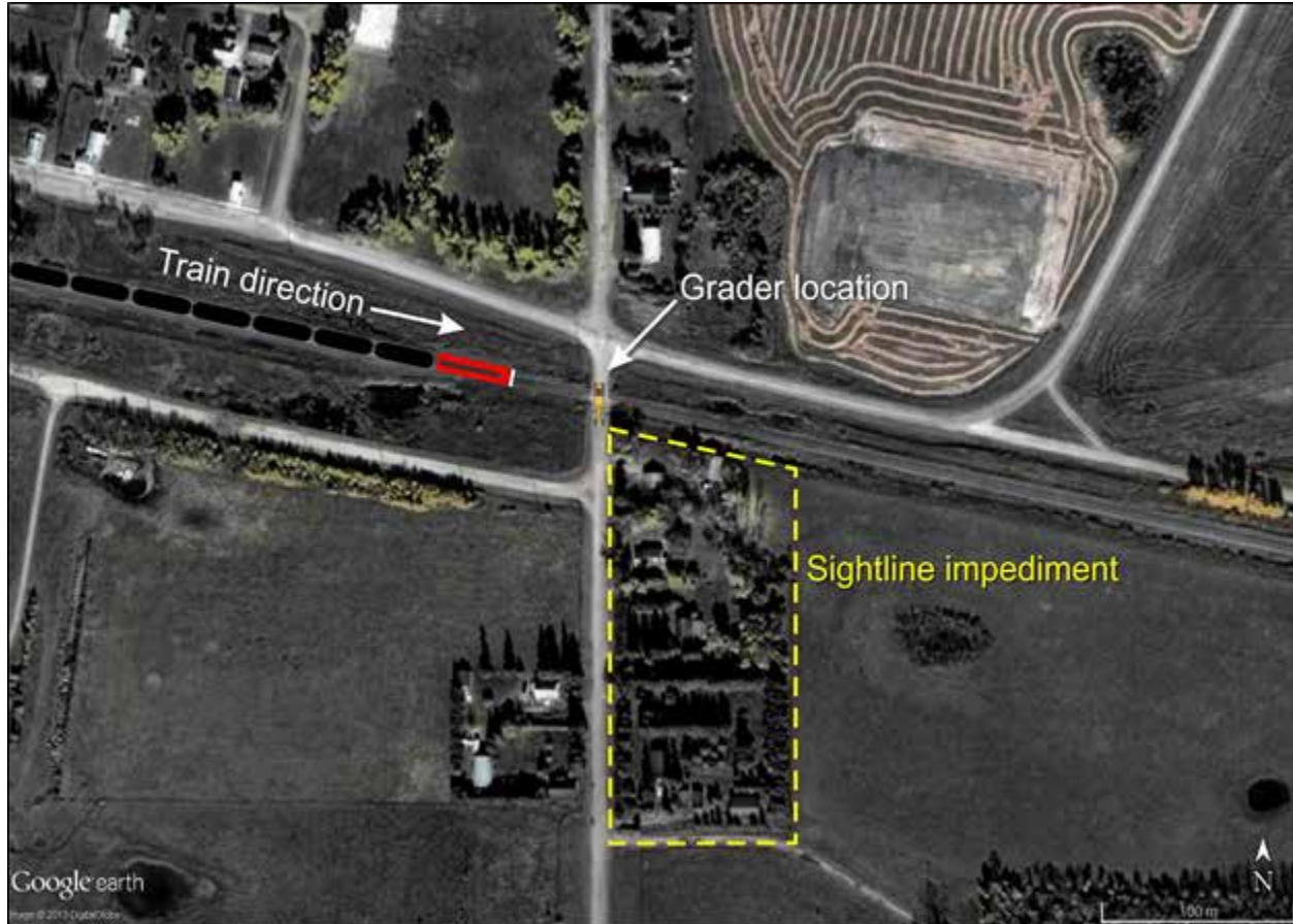
Photo 1. Crossing accident location