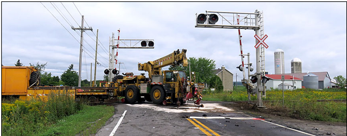
Figure 3. Accident site

The multi-crane was substantially damaged. The windows on either side of the cabin were shattered. The multi-crane boom locking mechanism was broken and the boom was turned approximately 30°. The devices on the tip of the boom and attached to the front of the multi-crane were destroyed (Figure 4).