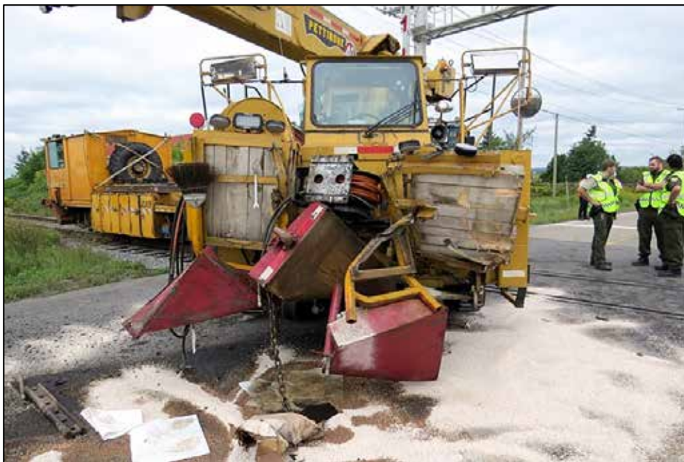
Figure 4. Front view of the multi-crane

The tractor-trailer, which had been loaded with sand, came to rest on the roadway approximately 150 feet (46 m) east of the crossing. The tractor and trailer were still attached and had jackknifed (Figure 5). The tractor was significantly damaged. The front of the cab had impact marks above the passenger door. The roof and part of the rear of the cab had been torn off and launched into the ditch.