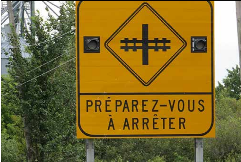
Figure 2. Active advance warning sign (Translation: PREPARE TO STOP)

An examination of sight distances found that road vehicles coming from the west and travelling at the authorized speed became visible to an observer located in the southeast quadrant of the crossing 17 seconds before they entered the crossing, meaning at a distance of approximately 1400 feet (427 m).