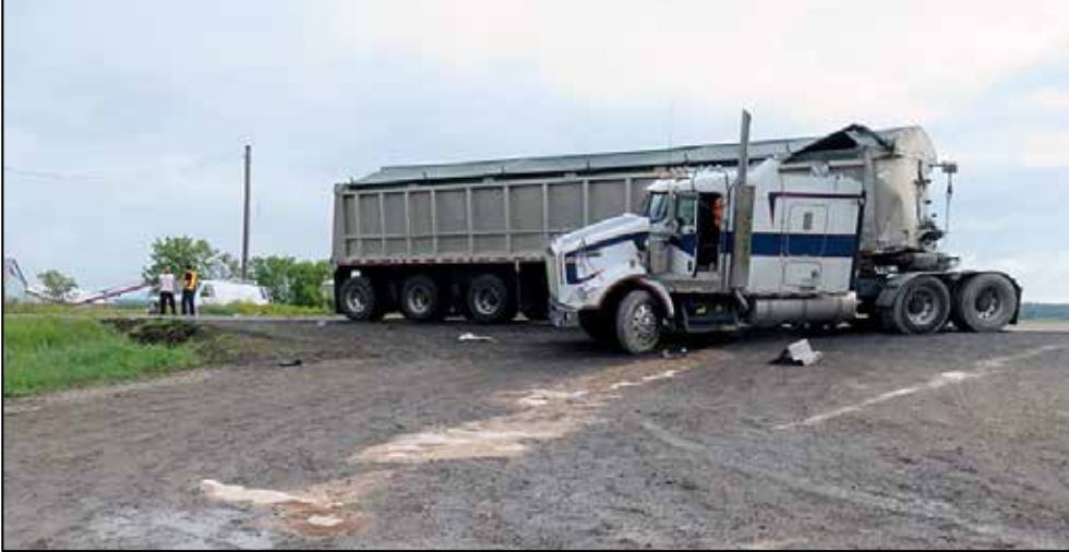
Figure 5. Resting position of the tractor-trailer

The track and the crossing sustained minor damage. Two flashing lights in the northeast quadrant of the warning system were shorn off.